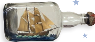
Model of the Eliza Thornton given to US Sisters by British Province on the 150th Anniversary.

This year 2015 marks also the 175th Anniversary of the Sisters of Notre Dame de Namur (SNDdeN) in America.