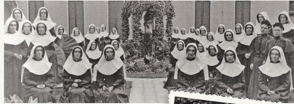
34 novices, 2 postulants in Ohio ~ 1890

“Across borders, cultures and generations, we pray that... we are a visible prophetic witness...” Chapter Calls 2014