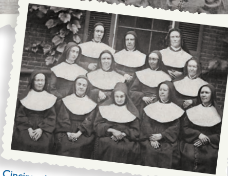
Cincinnati community of Sisters ~ 1870